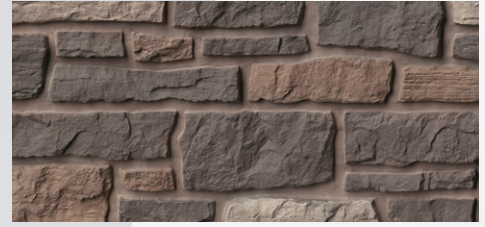
Bucks County Gray