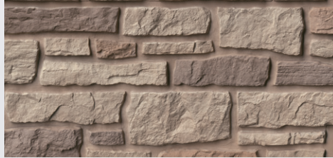
Rocky Mountain Clay