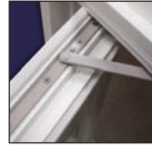
Optional Stainless Steel Hardware