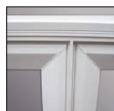
Continuous Master Frame