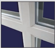
SDL Simulated Divided Lites

Our SDL option includes contour grids mounted on the exterior of the glass with a high bond adhesive system. A shadow bar placed between the panes of insulated glass completes the look.