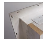
Optional New Construction Fin