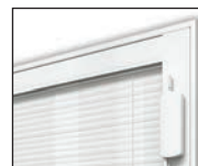
LIFT AND TILT PRIVACY BLINDS