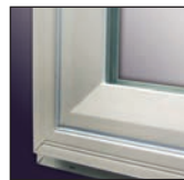
Stylish Beveled Frame